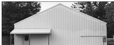
#83759/$94,500/RAZIL • Completely Finished Steel Bldg. • High Traffic Area Call Dan Today!