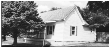
#83959/$59,900/BRAZIL * 2 Bedroom, 1 Bath * 1014 Square Feet • Basement Call Kim Today!

SERVICE YOU DESERVE. THE NAME YOU CAN TRUST. ®