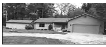
#82909/$249,900/BRAZIL • 3 Bedroom, 2 Bath • 1680 Sq Ft Home • Rental Home Income • 4 Car Garage Parking • Call Debbie Today!