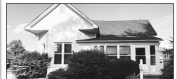
#84040/$112,000/BRAZIL • 4 Bedrooms, 2 Baths • Partial Basement • 1 Car Garage Call Kathy Today!