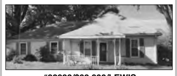
#82983/$68,900/LEWIS • 3 Bedroom, 1 Bath • 2 Car Garage • 3.2 Acres Lot • Call Kathy Today!