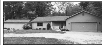
#83523/$219,000/BRAZIL 3 Bedroom, 2 Bath • 1,680 Sq. Ft. Home • Call Debbie Today!