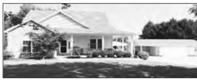
#84154/$489,900/TERRE HAUTE • 2 Bedroom, 2.5 Bath * Horse Property • 32 + Acres Call Kim Today!