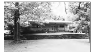
#83687/$259,000/CARBON • 4 Bedroom, 3 Bath • 2 Car Garage • 20 Acres Call Molly Today!