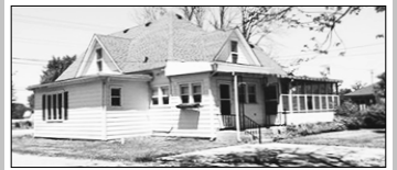
#83454/$62,500/BRAZIL • 3 Bedroom, 1 Bath • Corner Lot, Enclosed Porch Call Today!