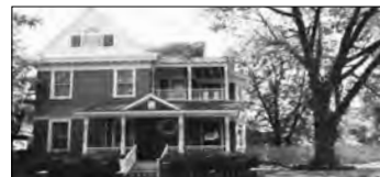
#84124/$260,000/TERRE HAUTE * 5 Bedrooms, 4 Baths • 4 Car Garage • Farrington Grove Area Call Molly Today!